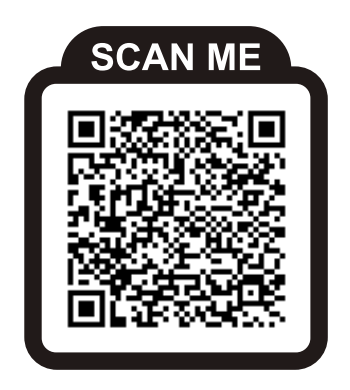
FOR "WORDS THAT BUILD" PDF